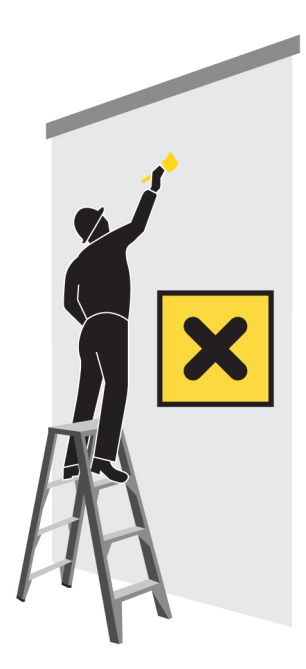
Never straddle or stand above the second tread below the top plate.

A second person or a physical barrier (eg witches hats) may be necessary to ensure the ladder is not knocked by passing traffic or pedestrians. A second person may be required for assisting with the raising or lowering of plant or materials.